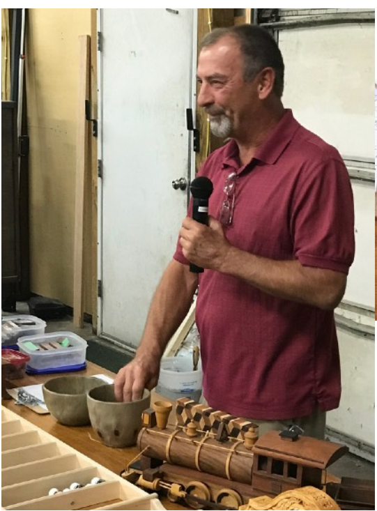
Denny Dukes: band-sawn fish from basswood, no, it's not a bass.