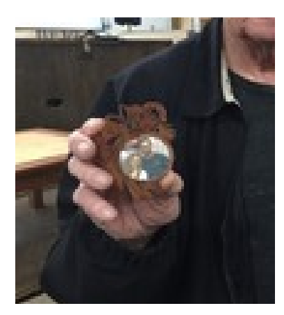
Mark Padesky: A special thanks to Mark for his informative description of what it takes to produce Maple Syrup. Example, tapping 90+ trees, or collecting 40 gallon of sap to yield one gallon of syrup.